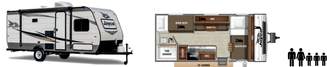
Jay Flight SLX Trailer