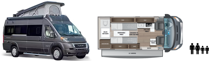
B19 ft Van