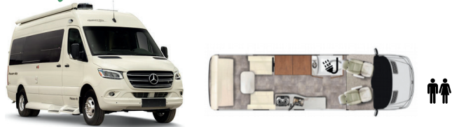
B22 ft Sprinter